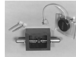
TCCE90 ASTM D1816 and ASTM D877

European Contact Haefely Test AG Lehenmattstrasse 353 CH-4028 Basel Switzerland ☎ + 41 61 373 4111 📠 + 41 61 373 4912 ✉ sales@haefely.com