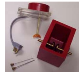
TCVDE ASTM D1816